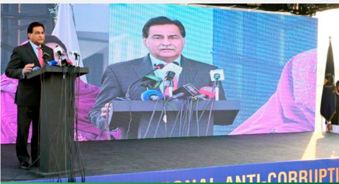
Islamabad, 10th December 2025: Speaker National Assembly, Sardar Ayaz Sadiq addressing the Participants of "Awareness Walk against Corruption" at Pakistan Sports Complex.