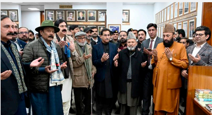
Islamabad, 8th December 2025: Speaker NA Sardar Ayaz Sadiq along with Federal Minister Chairman Parliamentary Committee on Kashmir Rana Muhammad Qasim Noon inaugurated the "KASHMIR CORNER" established in the library to highlight the Kashmir Cause.