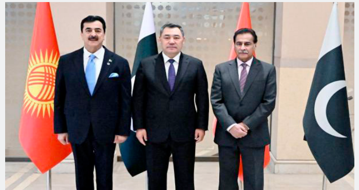
Islamabad, 4th December 2025: Speaker National Assembly, Sardar Ayaz Sadiq in a group photo with President of the Kyrgyz Republic, H.E Sadyr Japarov & Chairman Senate, Syed Yousaf Raza Gillani.