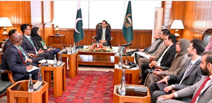
Islamabad, 12th November 2025: Speaker National Assembly, Sardar Ayaz Sadiq in a meeting with Parliamentary delegation from the Federal Republic of Somalia headed by Deputy Speaker House of Peoples of the Federal Republic of Somalia, Ms. Sadiya Yassin Haji at Parliament House.