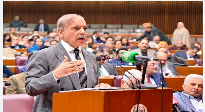
Prime Minister Muhammad Shehbaz Sharif addressing the National Assembly during the 21st Session following the passage of the Constitution (Twenty-Seventh Amendment) Bill, 2025.

The motion for immediate consideration of the Bill, moved by the Minister for Law and Justice, Senator Azam Nazeer Tarar, was adopted by division, with 231 Members voting in favor and four against, thereby meeting the required constitutional threshold. A detailed debate followed, during which Members from both treasury and opposition benches participated in the discussion.