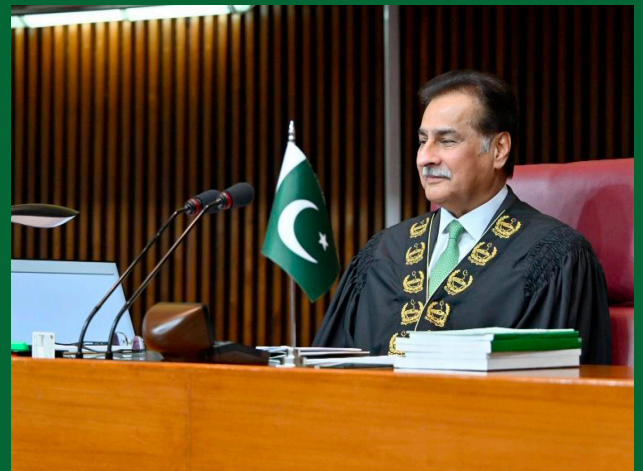
Majlis-e- Shoora (Parliament) Meet in Joint Sitting to advance Legislative Agenda