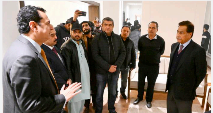
Islamabad, 06th January 2026: Speaker National Assembly, Sardar Ayaz Sadiq, inspecting the construction work of the New Parliament Lodges Project.