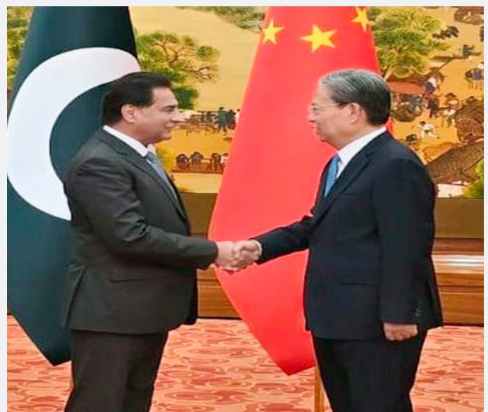
Beijing, 20th January 2026: Hon'ble Speaker of the National Assembly, Sardar Ayaz Sadiq met with Chairman of the Standing Committee of China's National People Congress (NPC) Mr. Zhao Leji during their official visit.

the Speaker stressed that strengthened inter-parliamentary exchanges and the active role of Parliamentary Friendship Groups would significantly contribute to deepening bilateral engagement and reinforcing the strategic partnership between Pakistan and China. Hon'ble Speaker of the National Assembly, Sardar Ayaz Sadiq noted that the Pakistan–China partnership remained vital for sustainable peace, development, and prosperity in the region.