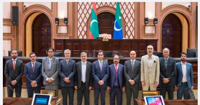
Maldives, 17th December 2025: Parliamentary delegation led by Hon'ble Speaker National Assembly, Sardar Ayaz Sadiq, during an official tour of the People's Majlis, Maldives.