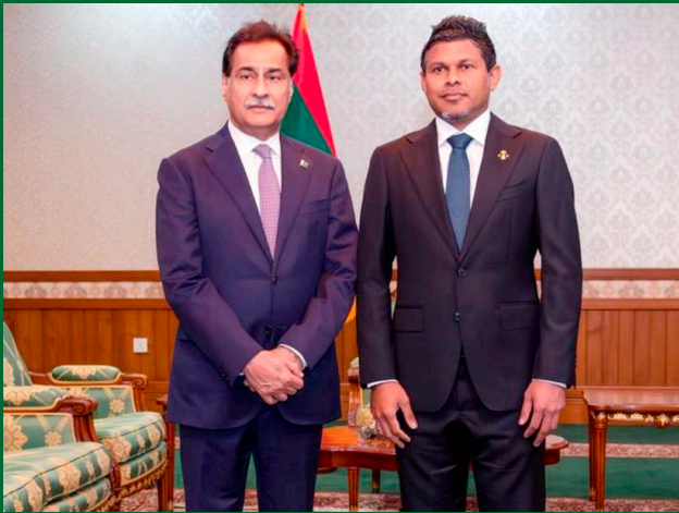
Strengthening Parliamentary and Regional Ties with Maldives