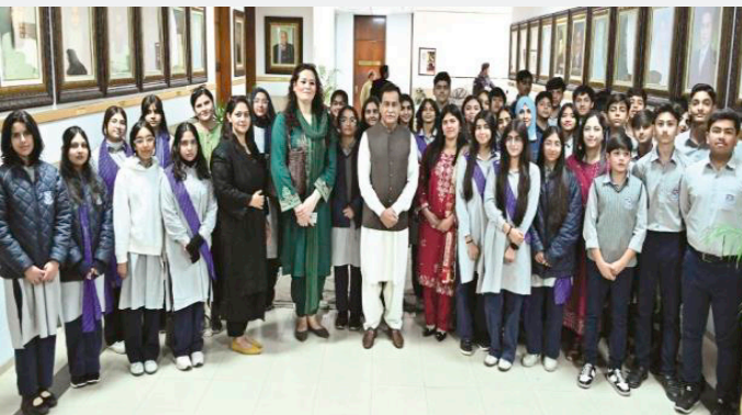
Islamabad, 28th November 2025: Speaker National Assembly, Sardar Ayaz Sadiq in a group photo with Students and Faculty Members from Beacon house School System Wah Cantt at Parliament House.