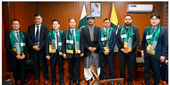
Islamabad, 29th January 2026: Federal Minister and Chairman Parliamentary Committee on Kashmir, Rana Muhammad Qasim Noon, in a meeting with a high-level parliamentary delegation from the Republic of Korea, in Parliament House.

Islamabad, 29th January 2026: Meeting with Korean Delegation: Federal Minister and Chairman of the Parliamentary Committee on Kashmir, Rana Muhammad Qasim Noon, met with a high-level parliamentary delegation from the Republic of Korea on January 29, 2026. The discussions focused on Pakistan–South Korea bilateral relations, the regional situation, and the Jammu and Kashmir dispute. The Minister briefed the delegation on the latest developments in Indian Illegally Occupied Jammu and Kashmir (IIOJK), emphasizing ongoing human rights concerns and reiterating that a just resolution of the dispute, in accordance with UN Security Council resolutions, is essential for lasting peace in the region. The visiting delegation appreciated the warm reception and reaffirmed the importance of enhanced parliamentary cooperation between the two countries.