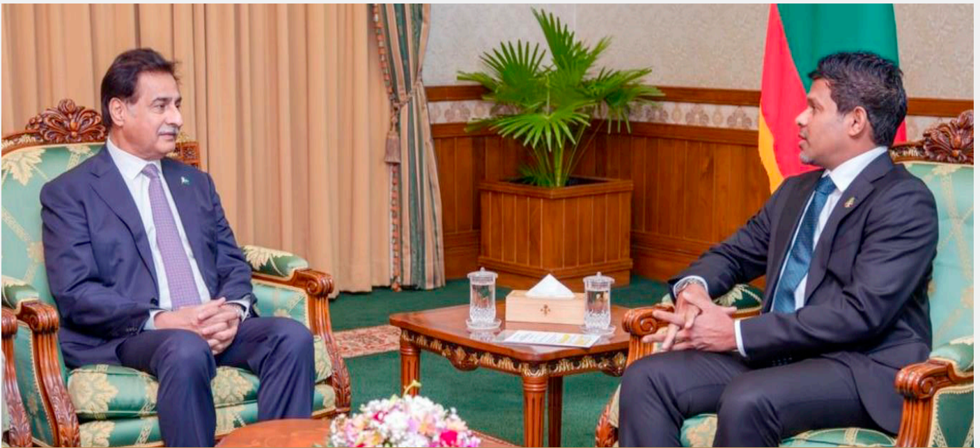
Malé, 19th December, 2025: The Hon'ble Speaker of the National Assembly, Sardar Ayaz Sadiq with Vice President of Maldives, Mr. Hussain Mohamed Latheef.

Malé, Maldives — 16th to 20th December, 2025