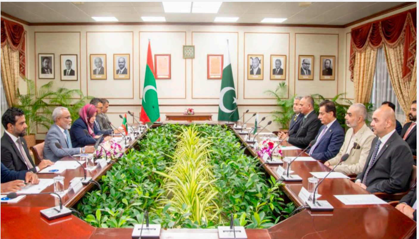
Malé, 17th December, 2025: The Hon'ble Speaker of the National Assembly of Pakistan, Sardar Ayaz Sadiq met with the Hon'ble Speaker of the People's Majlis of the Maldives, Abdul Raheem Abdulla.

The Pakistani parliamentary delegation accompanying the Hon'ble Speaker of the National Assembly, Sardar Ayaz Sadiq included MNAs:- Mr. Salahuddin Junejo, Mr. Naveed Amir Jeeva, Mr. Mehmood Qadir Khan, Mr. Bilal Farooq Tarar, Mr. Muhammad Bilal Badar, and Mr. Daniyal Ahmed.