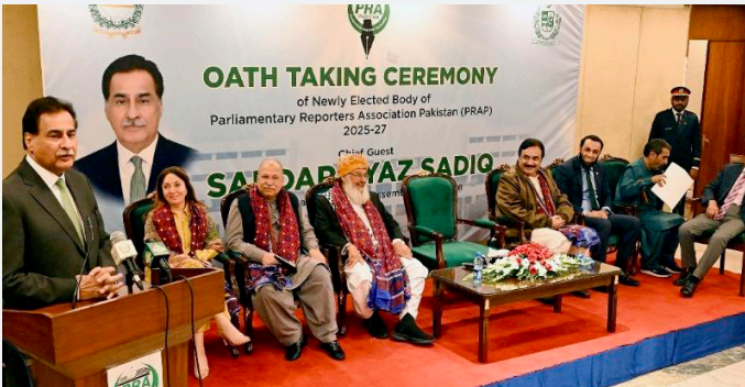
Islamabad, 2nd December 2025: Speaker National Assembly, Sardar Ayaz Sadiq addressing the participants during the Oath Taking of the Elected Body of the Parliamentary Reporter's Association (PRA) at Parliament House.