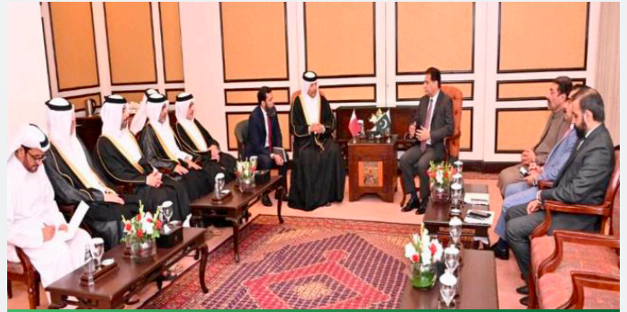
Islamabad, 10th November 2025: Speaker National Assembly, Sardar Ayaz Sadiq in a meeting with Parliamentary delegation from the State of Qatar headed by Speaker Shura Council of the State of Qatar, Mr. Hassan bin Abdulla Al-Ghanim