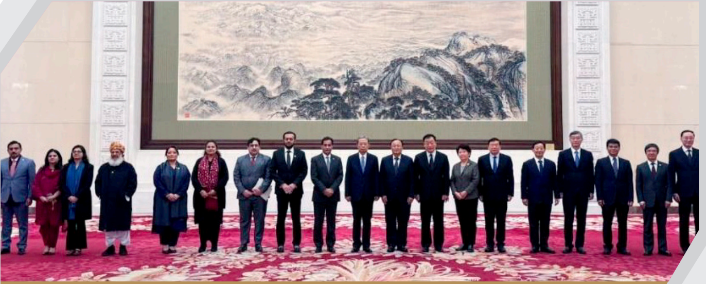
The Hon'ble Speaker of the National Assembly, Sardar Ayaz Sadiq leads official visit to China marking 75 years of Diplomatic Relations