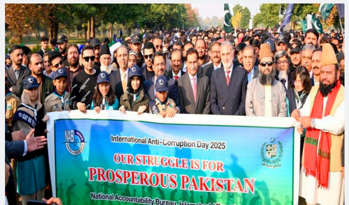
Islamabad, 10th December 2025: Speaker National Assembly, Sardar Ayaz Sadiq participating in the "Awareness Walk against Corruption" at Pakistan Sports Complex.