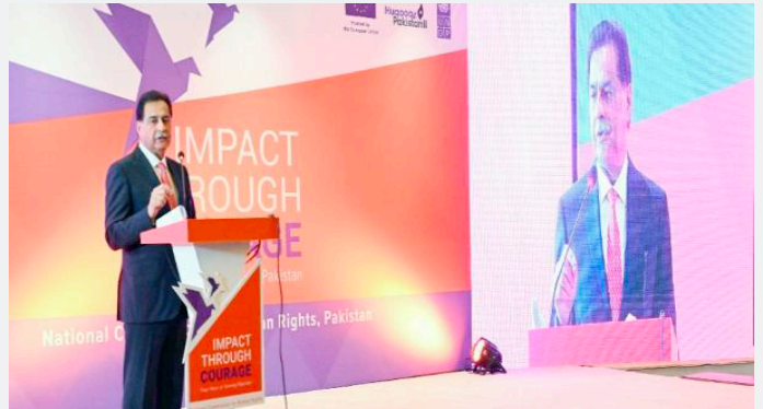
Islamabad, 25th November 2025: Speaker National Assembly, Sardar Ayaz Sadiq addressing the participants of National Commission on Human Rights event on "Impact Through Courage".