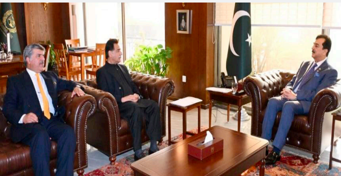
Islamabad, 13th January 2026: Speaker National Assembly, Sardar Ayaz Sadiq & Deputy Speaker National Assembly Syed Ghulam Mustafa Shah called on Chairman Senate, Syed Yusuf Raza Gillani at Parliament House.