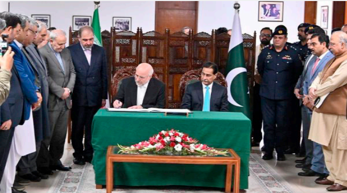
Islamabad, 5th November 2025: Speaker of the Islamic Consultative Assembly of Iran, Mohammad Bagher Ghalibaf inscribing his remarks in Visitor Book in Parliament House.