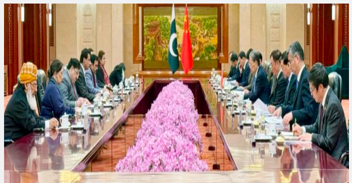
Beijing, 20th January 2026: Pakistani Parliamentary delegation led by Speaker NA Sardar Ayaz Sadiq in a meeting with Chairman of the Standing Committee of China's National People's Congress (NPC) Mr. Zhao Leji during their official visit at Beijing, China.