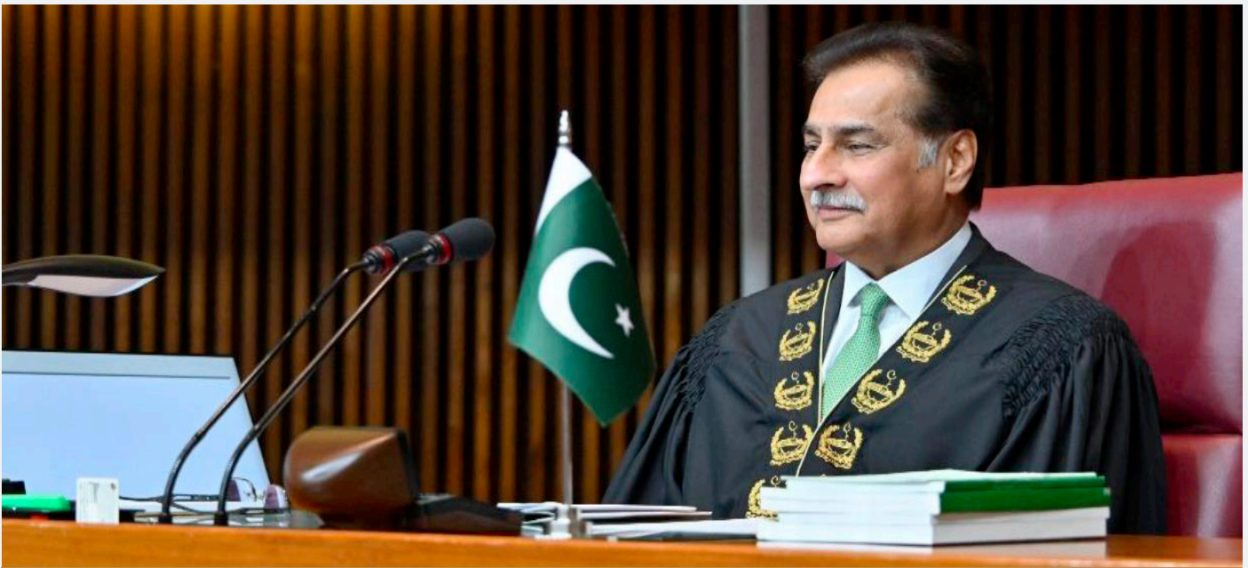
Islamabad, 2nd December 2025: Hon'ble Speaker of the National Assembly Sardar Ayaz Sadiq presiding over the Joint Sitting of Parliament.

The Majlis-e-Shoora (Parliament) convened in a Joint Sitting, presided over by the Hon'ble Speaker of the National Assembly, Sardar Ayaz Sadiq. The sitting witnessed substantial participation, with 233 Members of the National Assembly and 67 Senators in attendance.