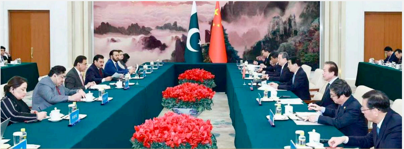
Beijing, 20th January 2026: The Pakistani parliamentary delegation, led by the Hon'ble Speaker of the National Assembly, Sardar Ayaz Sadiq, called on the Chairman of the Chinese People's Political Consultative Conference, Mr. Wang Huning.

Beijing, China — 19 th to 22 nd January 2026