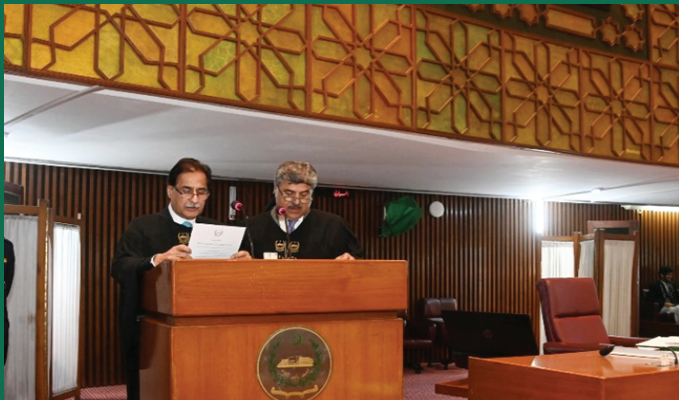
Syed Ghulam Mustafa Shah, Deputy Speaker, taking the oath from the Speaker Sardar Ayaz Sadiq at Parliament House, Islamabad on 1st March, 2024

Prominent politicians who were sworn in included PML-N