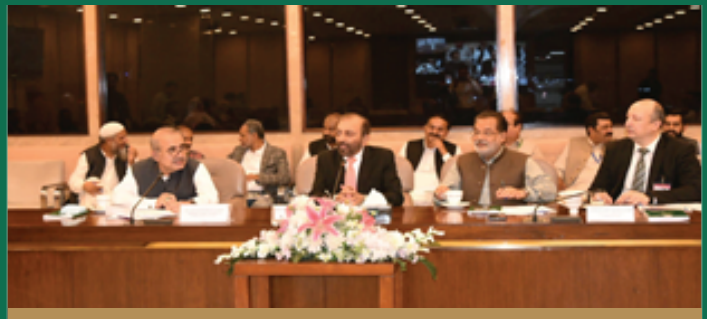
The National Assembly Standing Committee on Privatization elected MNA Dr. Farooq Sattar as its Chairperson in its meeting held on 29th June, 2024 at Parliament House.