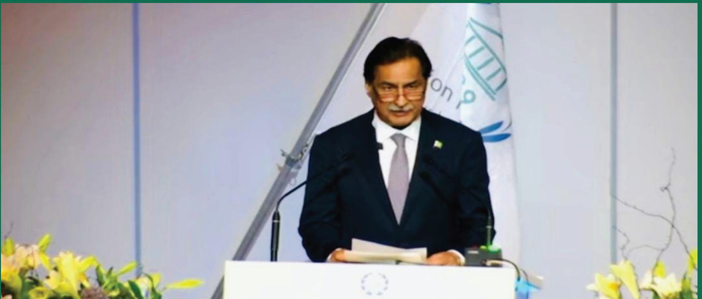
Speaker National Assembly, Sardar Ayaz Sadiq addressing the 148th Inter-Parliamentary Union (IPU) Assembly at Geneva, Switzerland on 24 March, 2024.

The 148th Inter-Parliamentary Union (IPU) Assembly held in Geneva, Honourable Speaker of the National Assembly of Pakistan, Sardar Ayaz Sadiq, delivered a powerful address that underscored the critical importance of democracy, peace, and the rule of law in fostering global growth and development.