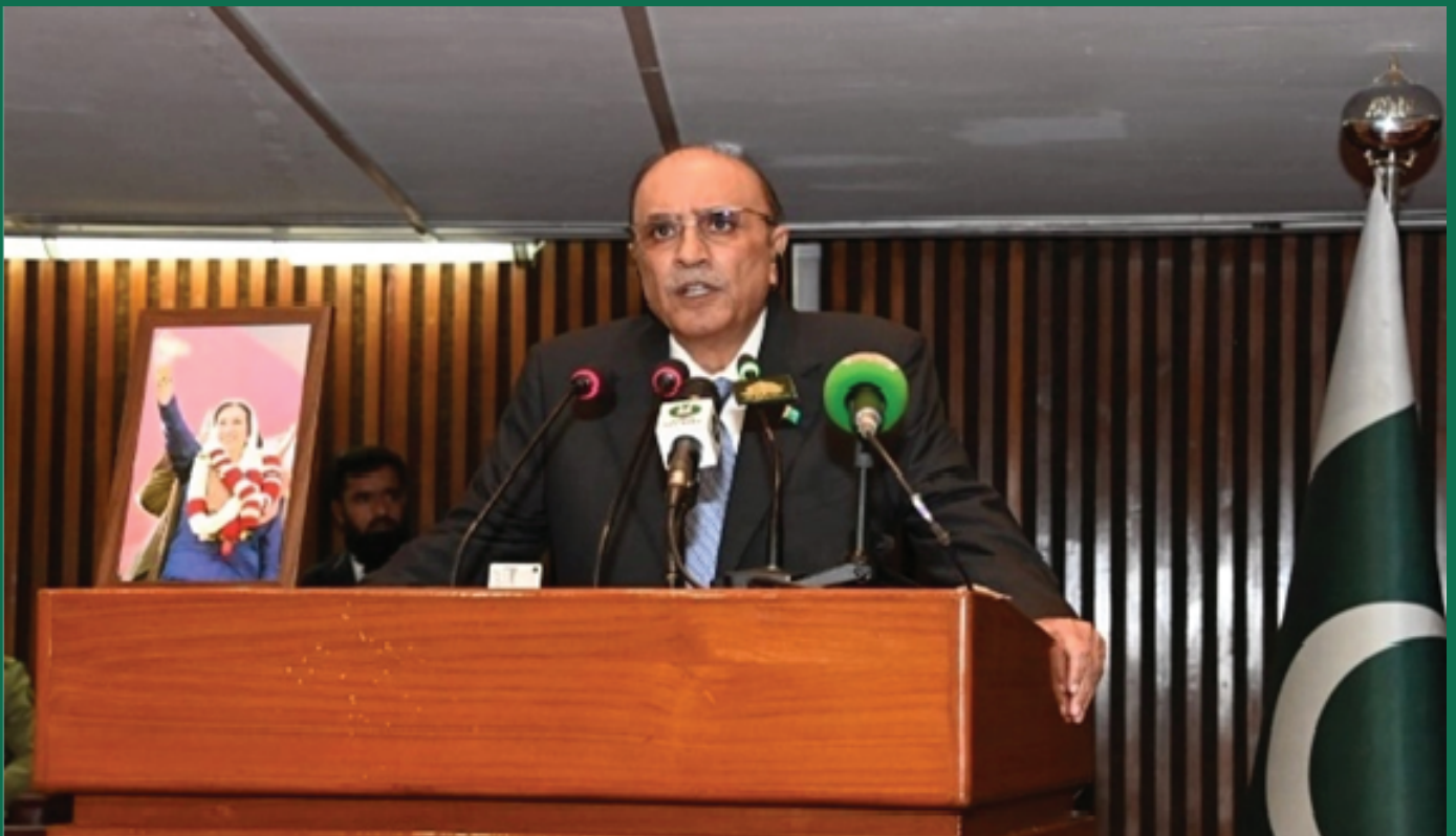
President Asif Ali Zardari addressing the Parliament on 18th April, 2024.

President Zardari concluded by reiterating the critical role of Parliament in the democratic process, urging members to rise above partisan divisions and work collectively for the nation's betterment. He expressed hope that the session would mark the beginning of a new era of cooperation and progress, with a renewed commitment to the principles of democracy and good governance.