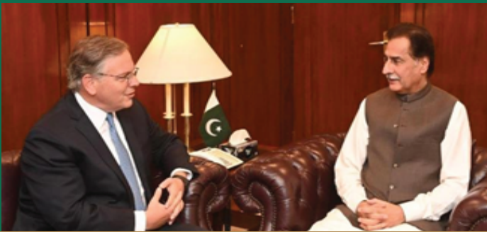
Ambassador Donald Blome's meeting with Speaker Ayaz Sadiq, focused on enhancing bilateral relations between Pakistan and the United States, at Parliament House on 16th March, 2024.