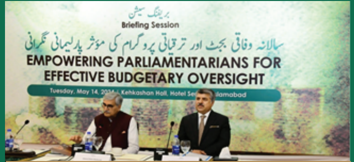
Deputy Speaker National Assembly, Syed Ghulam Mustafa Shah addressing the briefing session on Empowering Parliamentarians for Effective Budgetary Oversight on 14th May, 2024.