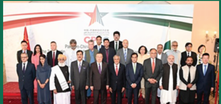
Speaker National Assembly Sardar Ayaz Sadiq in a group photo with participants of 3rd Pakistan-China Joint Consultative Meeting of Political Parties on CPEC in Islamabad on 21st June, 2024.