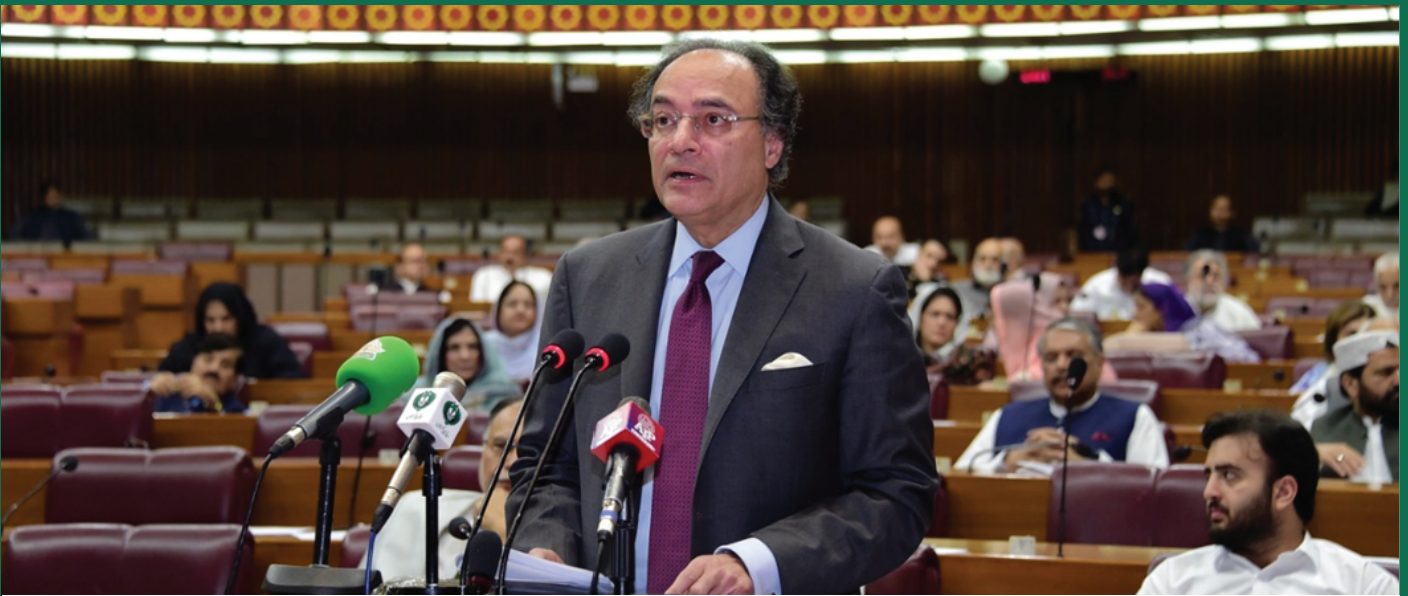
Finance Minister, Senator Muhammad Aurangzeb presented the budget during the budget session on June 12, 2024, at Parliament House, Islamabad.

The Federal Budget for the year 2024-2025 was presented by the Finance Minister Senator Muhammad Aurangzeb during the 6th session of the 16th National Assembly of Pakistan. The general discussion on the budget lasted for 58 hours and 35 minutes over 10 sittings.