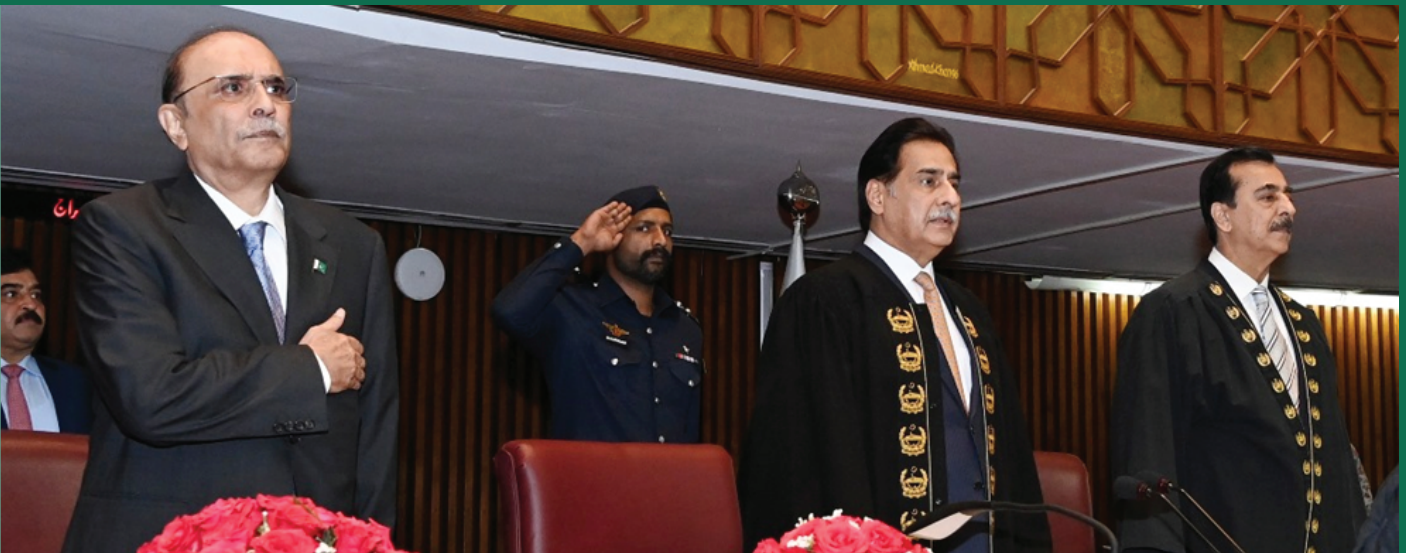
President of the Islamic Republic of Pakistan Asif Ali Zardari, Speaker National Assembly Sardar Ayaz Sadiq and Chairman Senate Syed Yousuf Raza Gillani at the commencement of 1st Parliamentary year, 18th April, 2024.

The first joint sitting of the Parliament of the 16th National Assembly was convened for the inaugural address by the President on April 18, 2024. The proceedings were scheduled to commence at 4 PM and lasted for 30 minutes. Out of 336 Members of the National Assembly (MNAs), 248 (74% of the total) were present, along with representation from the Senate and provincial legislatures. The Speaker of the National Assembly, Sardar Ayaz Sadiq, presided over the session and invited President Asif Ali Zardari to address the assembly.