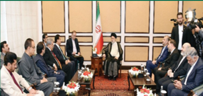
Speaker National Assembly, Sardar Ayaz Sadiq in meeting with Iranian delegation headed by President of Iran Dr. Seyed Ebrahim Raisi on 22nd April, 2024.