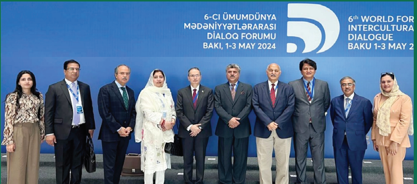
Deputy Speaker National Assembly, Syed Ghulam Mustafa Shah in a group photo with the participants of 6th World Forum on Intercultural Dialogue in Baku on 2nd May, 2024.

On May 2, 2024, Deputy Speaker of the National Assembly, Syed Ghulam Mustafa Shah addressed the 6th World Forum on Intercultural Dialogue in Baku, Azerbaijan where he highlighted the significance of cultural diversity and collaboration in an increasingly complex world.