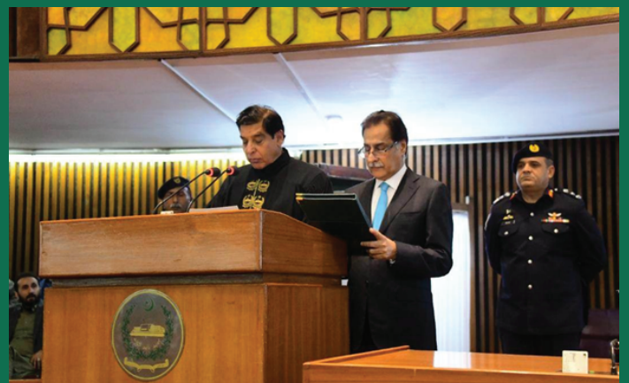
Sardar Ayaz Sadiq, taking the oath as a Speaker from the outgoing Speaker Raja Pervaiz Ashraf at Parliament House, Islamabad on 1st March, 2024

The House is currently short of 26 members due to a pending Supreme Court decision regarding SIC's eligibility for reserved seats for women and non-Muslims.