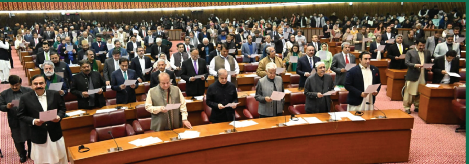
Members of the 16th National Assembly of Pakistan taking oath in the National Assembly Hall on February 29, 2024 at Parliament House, Islamabad.

The 16th National Assembly of Pakistan was constituted following the February 8th, 2024, elections. In these elections, no single political party achieved a simple majority, resulting in a coalition government.