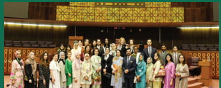
A delegation of Pakistan Foreign Office Women's Association (PFOWA) representatives and spouses of Ambassadors/ High Commissioners visited the Parliament of Pakistan on 29th May, 2024.