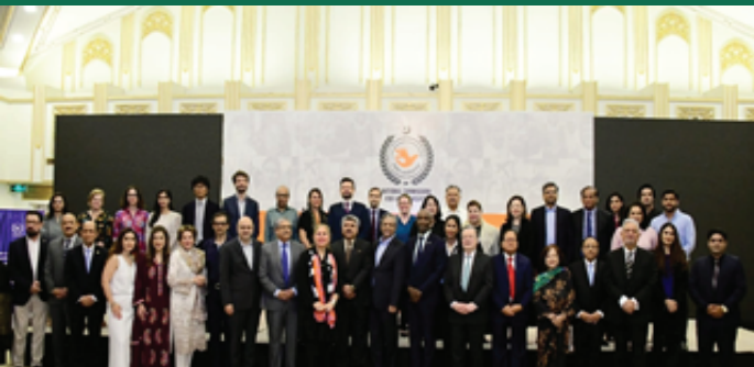
Deputy Speaker National Assembly Syed Mir Ghulam Mustafa Shah participated in the event organized by the National Commission for Human Rights Pakistan on 7th June, 2024.