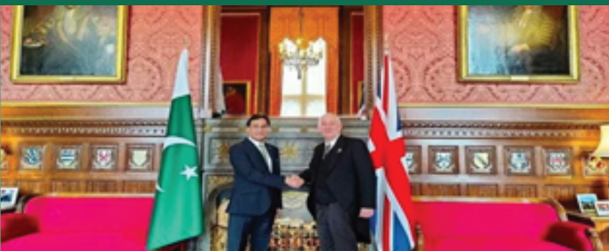
The Speaker, National Assembly of Pakistan, Sardar Ayaz Sadiq held a meeting with the Speaker of House of Commons, United Kingdom, Hon Sir Lindsay Hoyle at the House of Commons in London on 24th May, 2024.