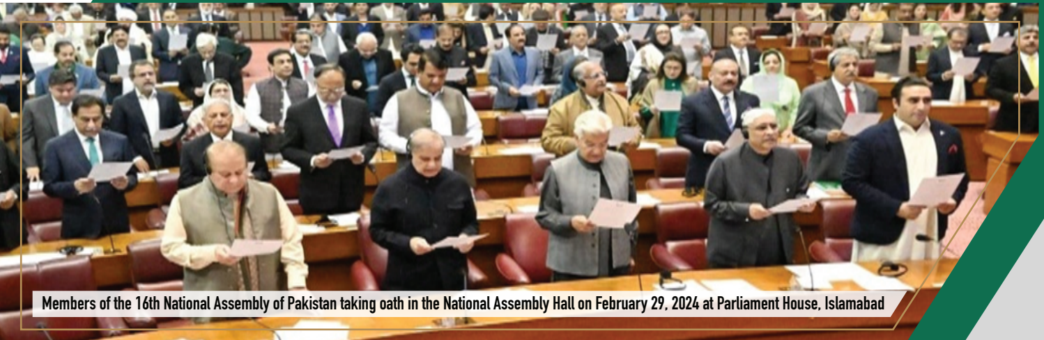
Members of the 16th National Assembly of Pakistan taking oath in the National Assembly Hall on February 29, 2024 at Parliament House, Islamabad

On February 29, 2024, three hundred and seventeen MNAs took oath during the 16th National Assembly's inaugural session.