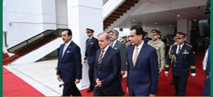
Speaker of the National Assembly, Sardar Ayaz Sadiq, receiving guests Prime Minister Shehbaz Sharif and Chairman Senate Syed Yousuf Raza Gilani at the Joint Session in Parliament House on 18th April, 2024