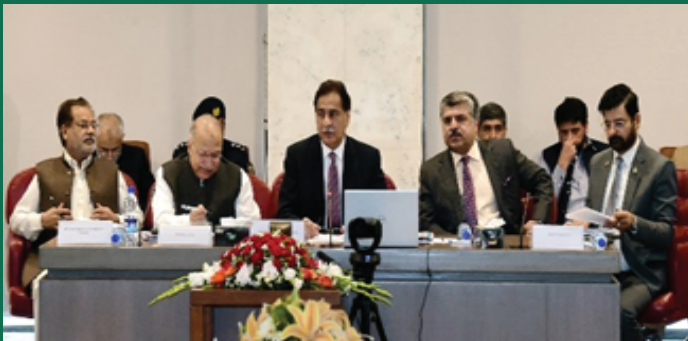
Speaker National Assembly, Sardar Ayaz Sadiq presiding the meeting of the National Assembly Strategic Plan Committee at Parliament House on 15th May, 2024.