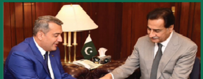
Ambassador of Azerbaijan to Pakistan H.E. Mr. Khazar Farhadov called on the Speaker of the National Assembly Hon. Sardar Ayaz Sadiq, at the Parliament House on 17th April, 2024.