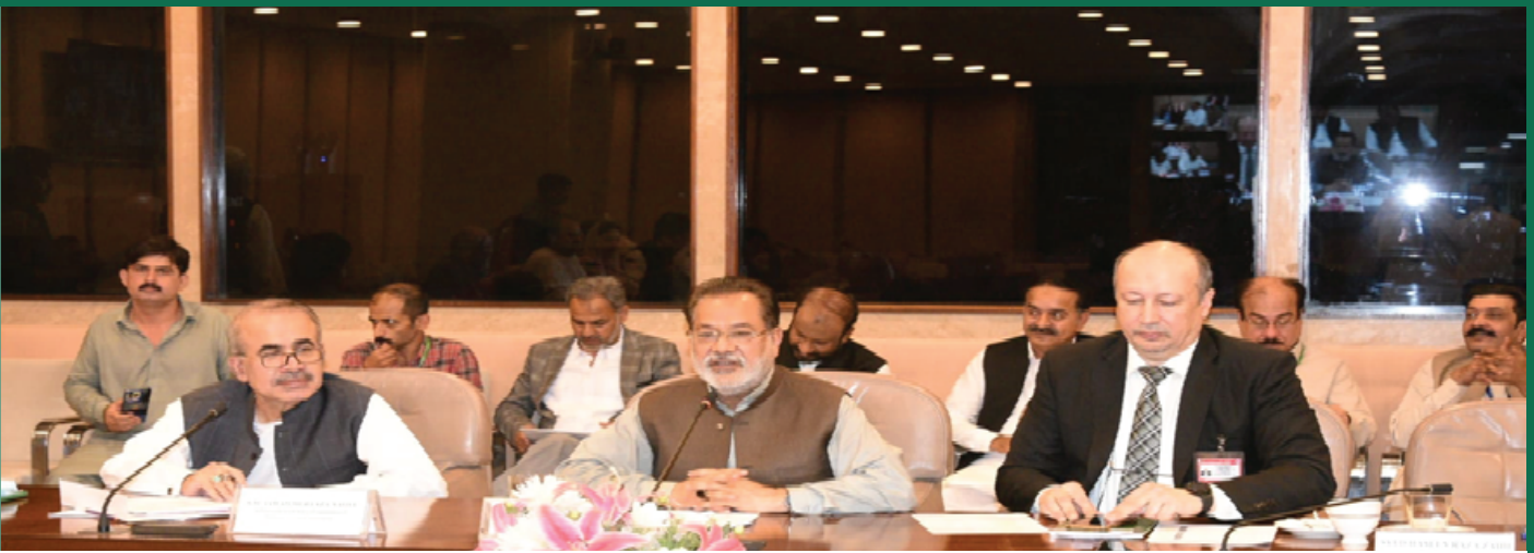
Elections for Standing Committees held on 29th June 2024 at the Parliament House, Islamabad.

taken in pursuance of the motion adopted during the National Assembly session held on 17th May 2024.