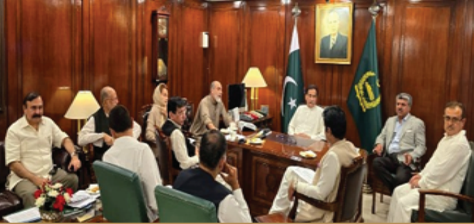
Speaker National Assembly, Sardar Ayaz Sadiq presiding meeting to discuss matters related to present and upcoming Budget Session of National Assembly at Parliament House on 13th May, 2024.