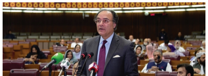
Finance Minister, Senator Muhammad Aurangzeb presented the budget during the budget session on June 12, 2024, at Parliament House, Islamabad.

The 16th National Assembly's 6th session saw the 2024-2025 Federal Budget presented and passed after 58 hours of intense debate across 10 sittings.