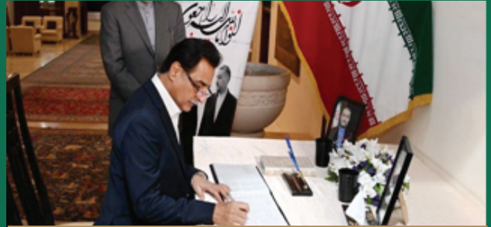
Speaker National Assembly, Sardar Ayaz Sadiq inscribing his remarks in condolence book at Iranian Embassy, Islamabad on 5th June, 2024.