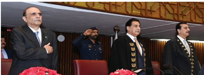
President of the Islamic Republic of Pakistan Asif Ali Zardari, Speaker National Assembly Sardar Ayaz Sadiq and Chairman Senate Syed Yousuf Raza before the Presidential Address to the Joint Session of the Parliament on 18th April, 2024.

The 1st Parliamentary year commenced with the address of the President to joint sitting of the Parliament on April 18, 2024. This session marked the formal inauguration of the new Assembly, with the President delivering the address, highlighting the government's legislative priorities and the agenda for the upcoming parliamentary term.