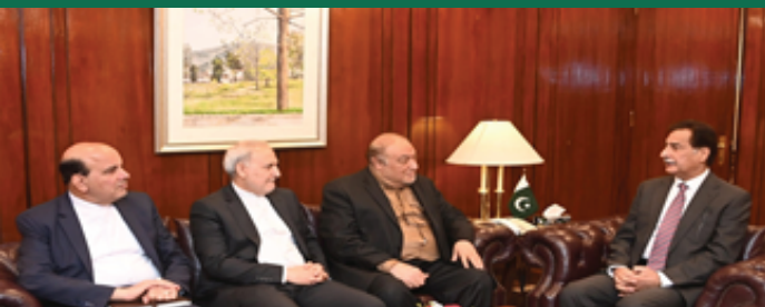
Speaker National Assembly, Sardar Ayaz Sadiq in a meeting with Iranian Parliamentary Delegation at Parliament House on 4th April, 2024.