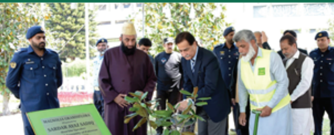
Hon. Speaker of the National Assembly, Sardar Ayaz Sadiq, plants a Magnolia Grandiflora sapling in the lawn of Parliament House on 25th April, 2024