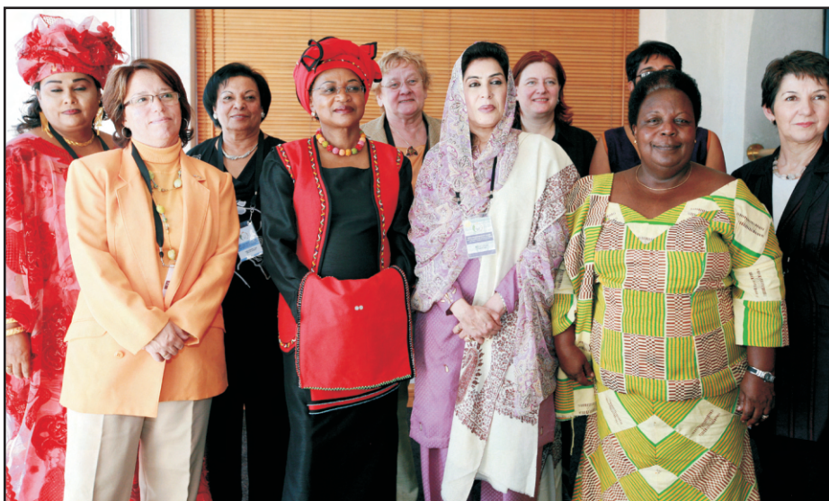
Dr. Fehmida Mirza with Women Speakers at the IPU

On the sidelines of the conference, many delegations requested to meet the Speaker. Dr. Fehmida Mirza met with the delegations from UK, China, Iran, Afghanistan, UN Deputy Secretary General, Secretary General of the IPU and discussed with them the issues of mutual interest.