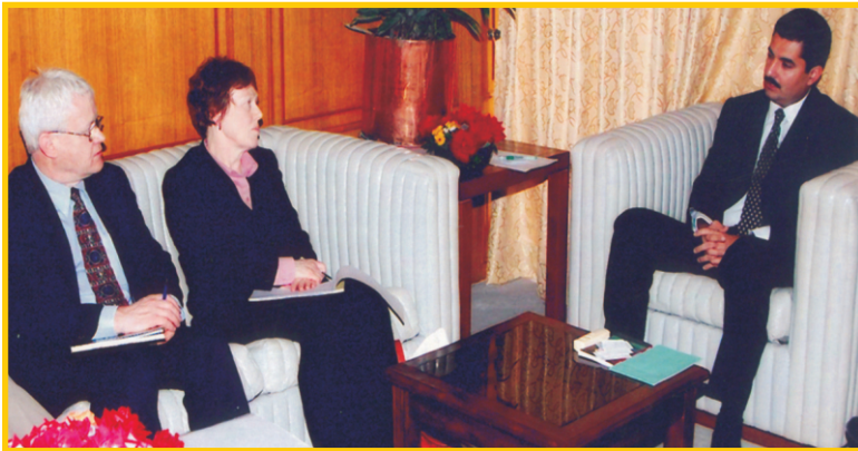
Canadian Delegation called on Acting Speaker National Assembly Faisal Karim Kundi at Parliament House on 14-04-2008.