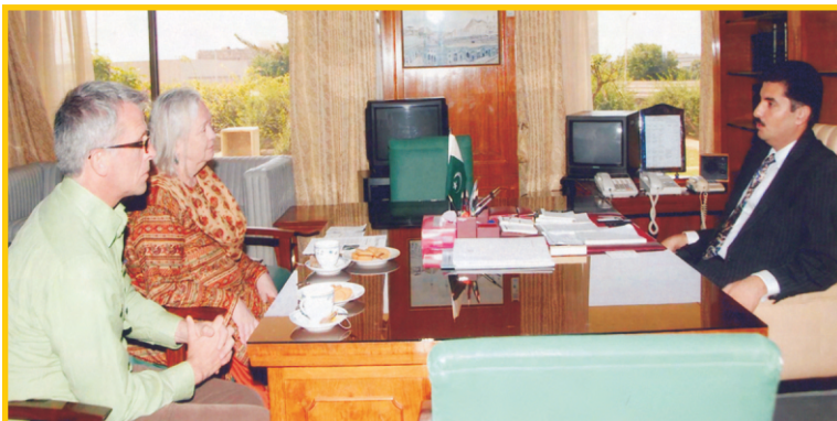
Director Health Office USAID Pakistan to Meets Deputy Speaker National Assembly Faisal Karim Kundi at Parliament House on 26-04-2008.