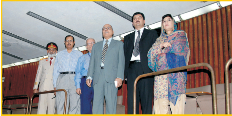
Honourable Speaker & Deputy Speaker visiting the Press Gallery in the National Assembly Hall alongwith Secretariat Staff (14-05-2008)