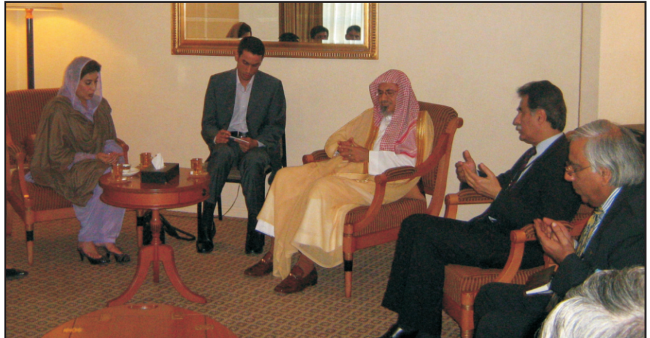
Imam of Kaaba offering Dua for Shaheed Mohtarma Benazir Bhutto