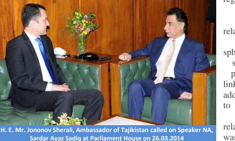
National Tailliston Mr. Mr.

has been registered in Pakistan-Tajikistan relations different spheres though; strengthening parliamentary linkages would add substance to the existing bilateral relations. He was talking to Ambassador of