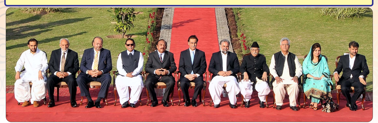
Group Photo of Presiding Officers of National & Provincial Legislatures and Legislative Assemblies on the occasion of inaugural ceremony of 17th Speakers' Conference at Parliament House

useful exchange of ideas and best practices among the Presiding Officers of the Legislatures enabling them to discuss issues of mutual concern for the promotion of Parliamentary traditions in Pakistan.