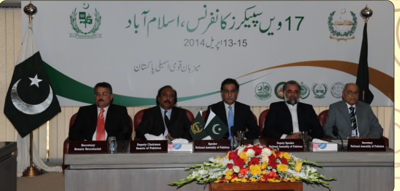
NA Speaker & Chairman of the 17th Speakers' Conference Sardar Ayaz Sadiq presiding inaugural session

In his inaugural address, the Hon'able Speaker highlighted the smooth transition of power from one elected Government to another. Referring to the Conference as an important milestone in the history of legislatures in Pakistan, the Honourable Speaker expressed his gratitude to all the partici-