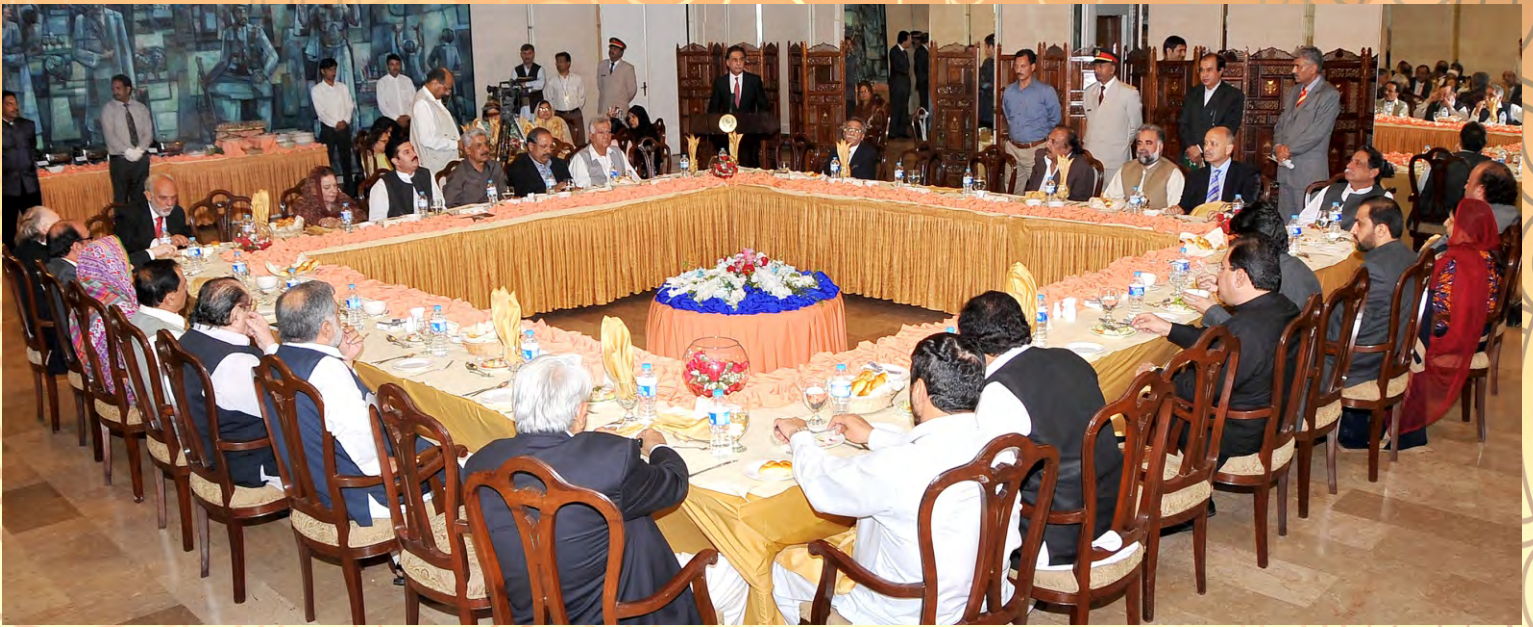
NA Speaker Sardar Ayaz Sadiq delivering his speech on the occasion of dinner hosted by Deputy Chairman Senate Sabir Ali Baloch in honour of the delegates of 17 th Speakers' Conference