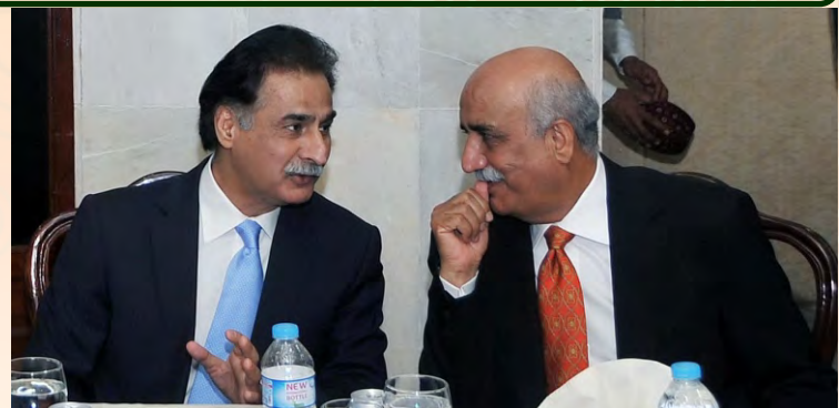
NA Speaker Sardar Ayaz Sadiq with Leader of the Opposition Syed Khurshheed Ahmed Shah