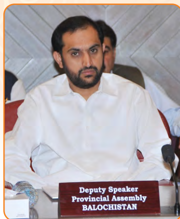
Deputy Speaker Provincial Assembly BALOCHISTAN