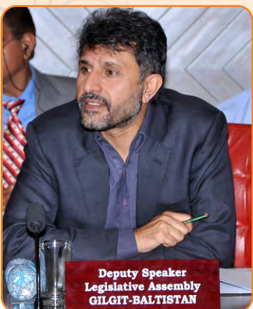
Deputy Speaker Legisitive Assembly GILGIT-BALTISTAN