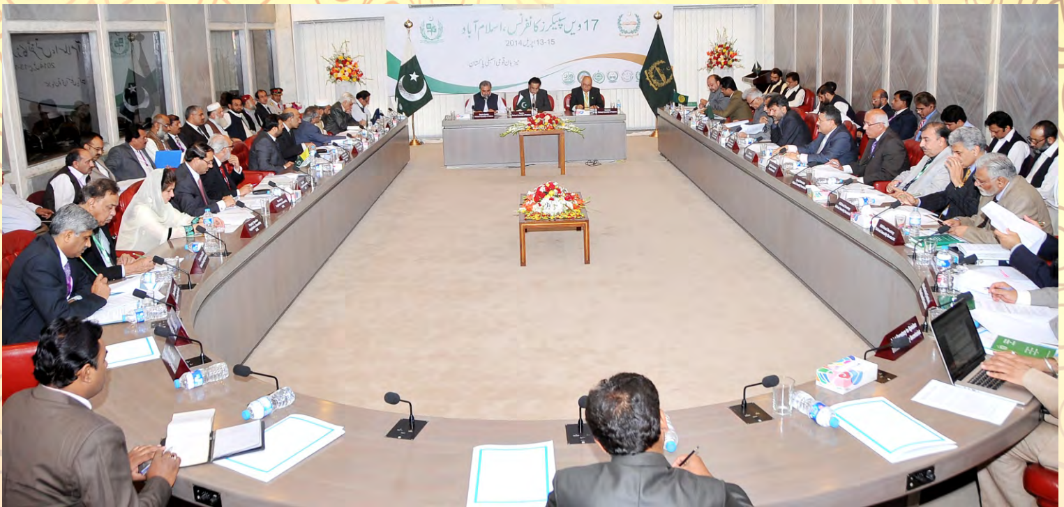
17 th Speakers' Conference in session

The Presiding Officers of the country's legislatures had a field day as they critically deliberated on an extensive agenda, pertaining to the legal, administrative & procedural business. They reviewed the implementation status of the 16-Point Agenda of the previous 16th Conference and also discussed the 11 issues, as raised in the current Conference Agenda.